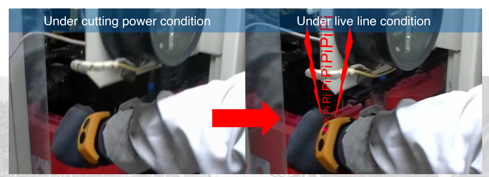
Voltage detection alarm with beeping and flashing